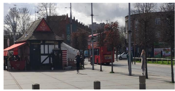
After -1 week later