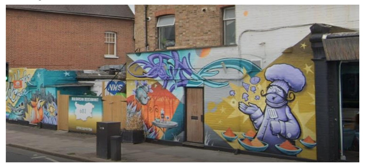
Before-Advertisement of restaurant

Officers visited the property and discussed with the owner and staff of the restaurant, after negotiations, it was moved via informal enforcement action, the results are below.